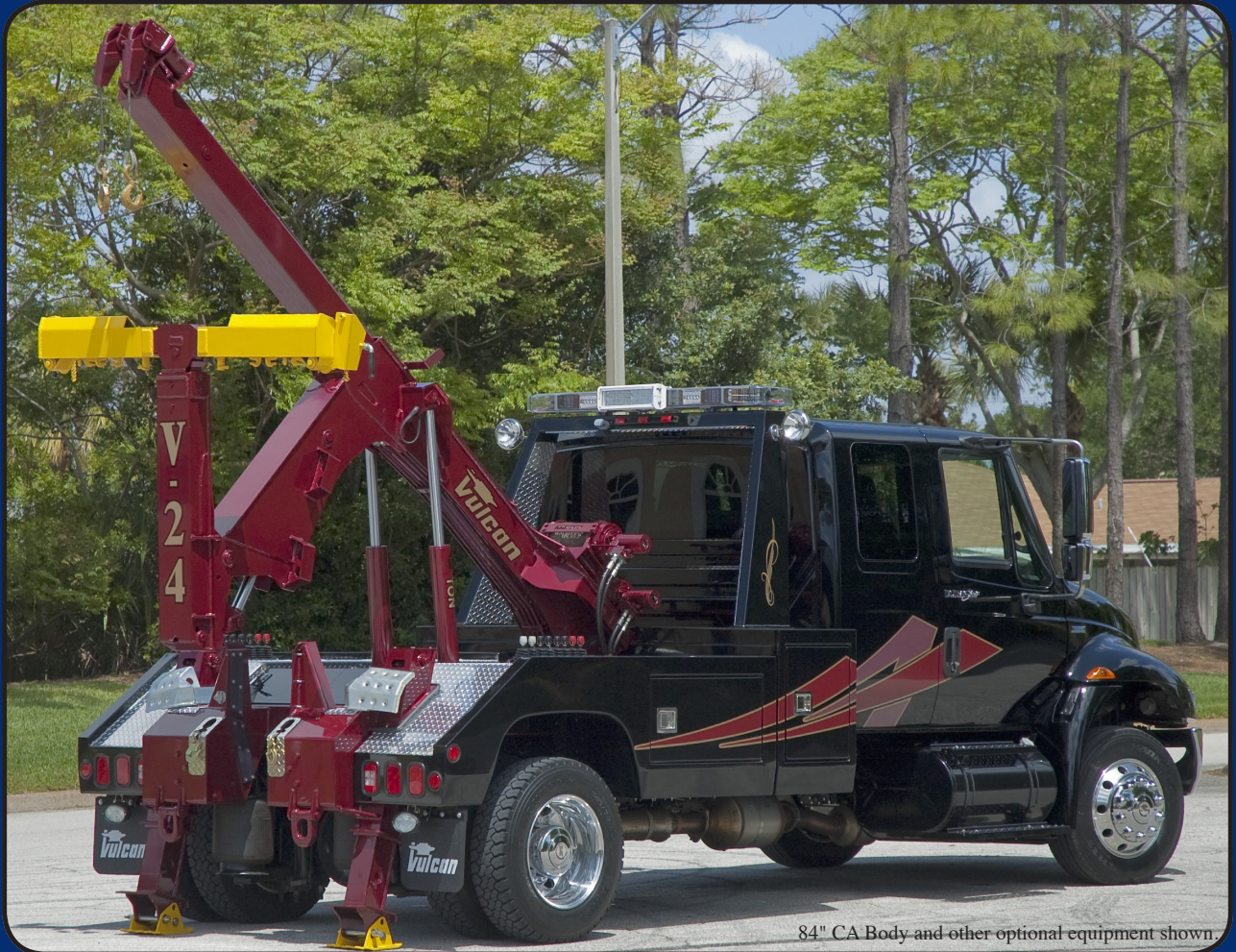
84" CA Body and other optional equipment shown.