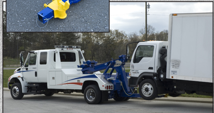
The fabricated underlift is rated at 7,000 lbs. lift capacity at its fully extended reach using lifting forks and has a tow capacity of 20,000 lbs. This makes the Vulcan V-24 ideal for towing a wide variety of light- and medium-duty trucks, as well as automobiles.