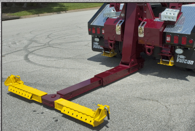
The V-24 comes standard with a low-profile crossbar with removable ends, one set of lift forks, fork holders and a 6,000-lb. Vulcan Wheel Retainer System.